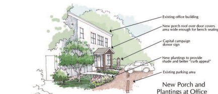
New Porch and Plantings at Office